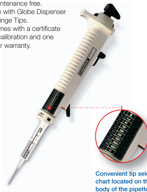
Convenient tip selection chart located on the body of the pipette.

All RV-Pette™ syringe tips are compatible with the Eppendorf® Repeater® Pipettor and most other popular repeat volume pipettors. Please inquire with your particular need.