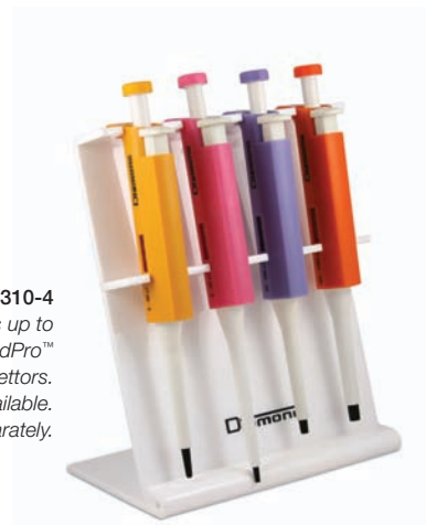
Item #3310-4 Pipettor Stand holds up to 4 Diamond or DiamondPro™ single channel pipettors. 6-Place stand also available. Each sold separately.

Available Diamond pipette tips fit all Diamond pipettors. See page 6 for ordering information.